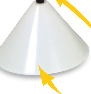
Spray shield to protect useful plants